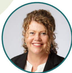
Lord Mayor Anna Reynolds