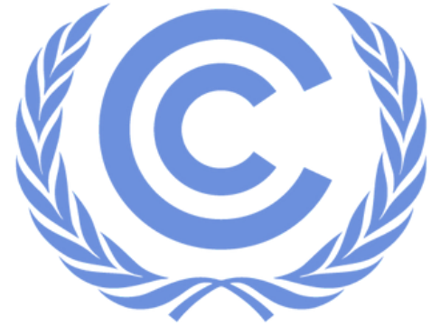
United Nations Framework Convention on Climate Change

By participating in the COP and leveraging ICLEI's resources, local governments can enhance their capacity to implement effective climate policies and advance their sustainability goals on the global stage.