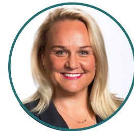
Lord Mayor Nuatali Nelmes