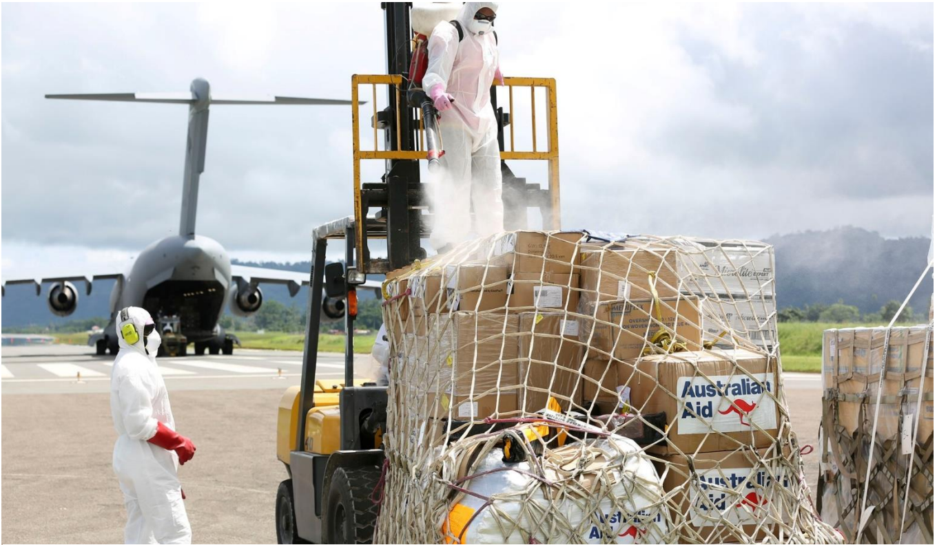
Some donor governments are already putting in place steps to ensure humanitarian relief is disinfected and does not expose the recipient to COVID-19