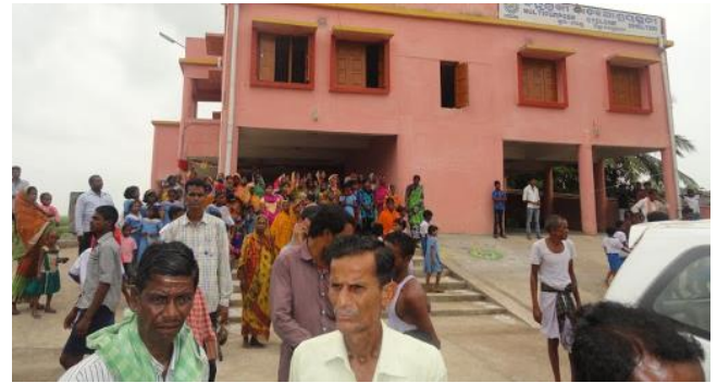
Shelters have helped save lives from weather disasters, but could serve as incubators for COVID-19

Disasters act on and exacerbate existing vulnerabilities which are often linked to gender, age, ethnicity, income, health and nutritional status, amongst other factors. COVID-19 has already proven to impact certain groups disproportionately for both epidemiological and socio-economic reasons iii . The twin impact of disasters and COVID-19 will have a far more adverse effect on groups that are already marginalised and vulnerable. At the same time, existing social protection measures are often not agile enough to respond to the needs of vulnerable individuals and households. In India, a substantial number of poor are excluded from social safety nets for various reasons, such as lack of appropriate identification to get a ration card iv .